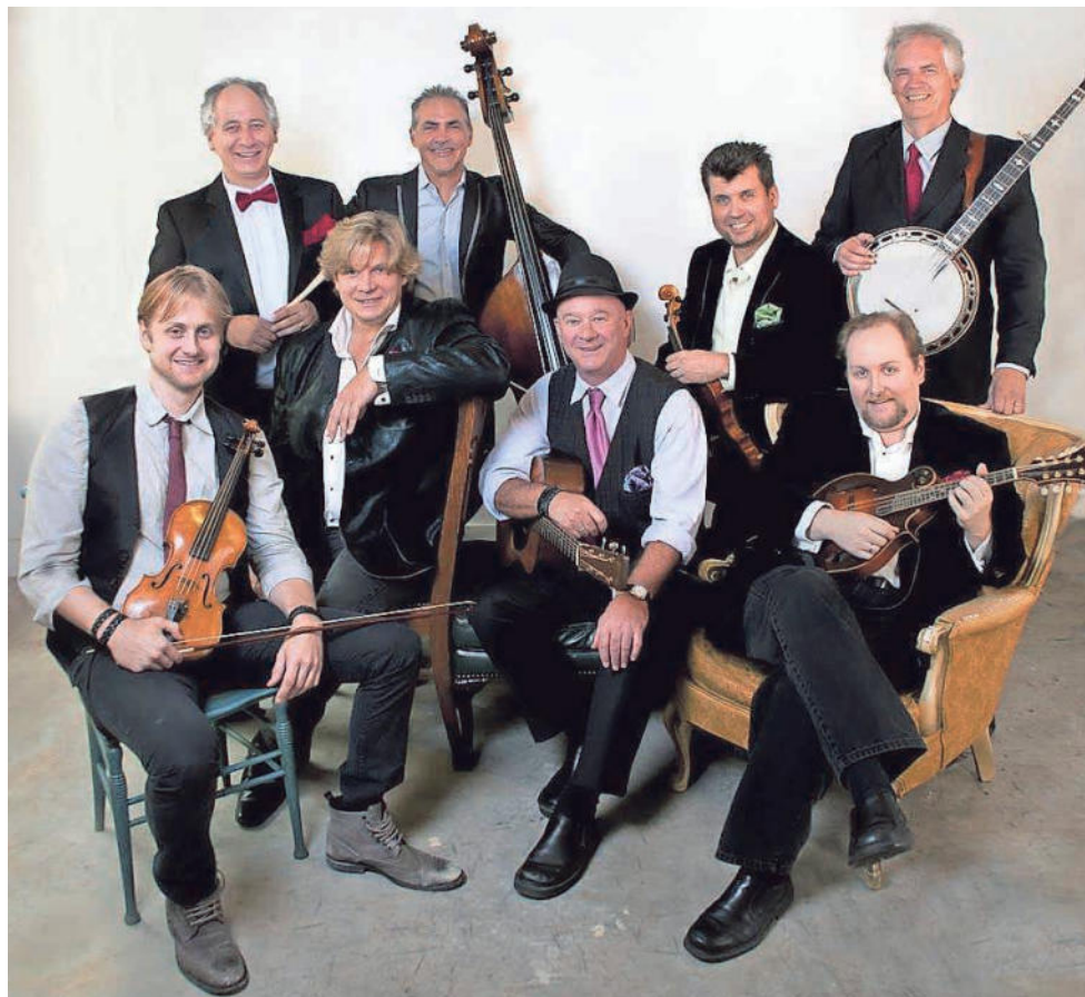
The DePue brothers bring their "grassical" style to the festival this week.